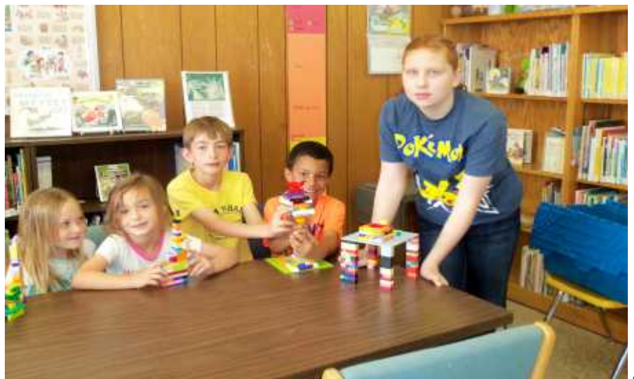
Pott-Wab Regional Library 2017 Summer Reading Program Photos