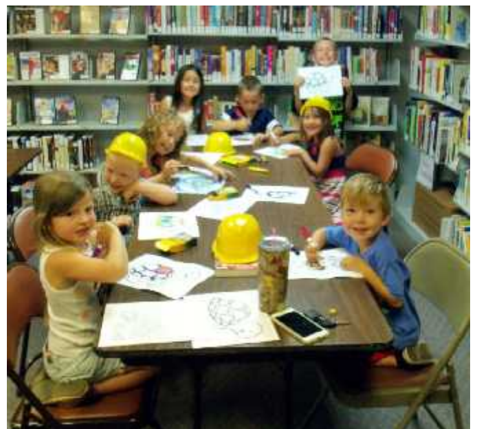
Pott-Wab Regional Library 2017 Summer Reading Program Photos